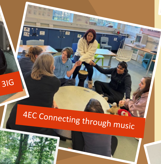
4EC Connecting through music