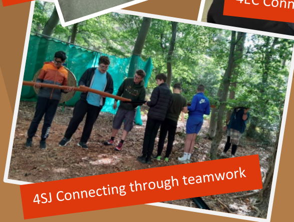
4SJ Connecting through teamwork