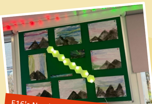
E16's Northern Light artwork display

Our school looks fantastic every day, but parents do not always get the chance to see the displays and learning taking place across our sites. Each week in the Spring Term, we will share displays from around the school, celebrating creativity and the learning experiences happening in our classrooms.