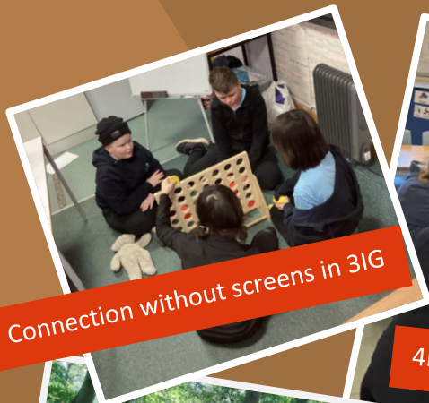
Connection without screens in 3IG

As we enter the Spring Term, we look forward to lighter days, warmer weather, and new growth across the school. We continue with our whole-school theme of Connections, sharing regular updates in the weekly newsletter. The Autumn Term successfully focused on sensory-rich learning, twinned class links, positive in-person engagement, and whole-school live performances. This spring, we aim to build on this strong foundation and are excited about the learning and experiences ahead!