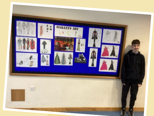
Oakley's fantastic fashion designs

Oakley's GCSE Art project - bold designs inspired by Lady Gaga that demonstrate his creativity, focus, and artistic talent.