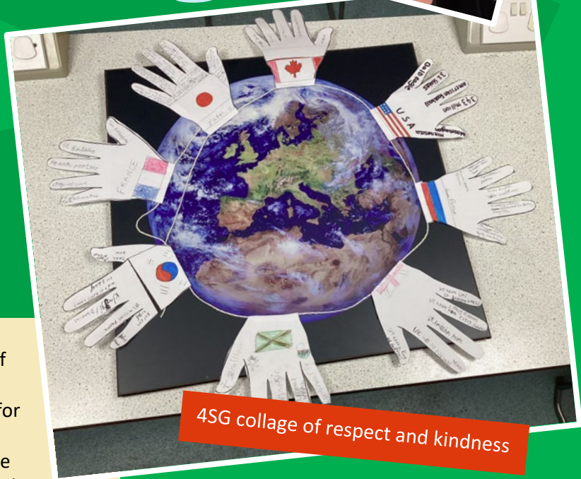
4SG collage of respect and kindness

Joy brought a variety of dishes from her Zimbabwean heritage for South Site to sample! One of those was a type of caterpillar that is fried and eaten in a sauce. Lots of staff and students were very brave in trying something new.