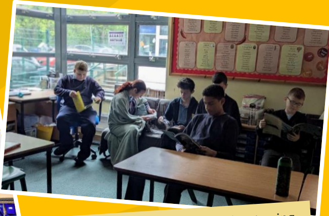
Above: 3MG spent a day without using lights – the picture shows them reading by sunlight.