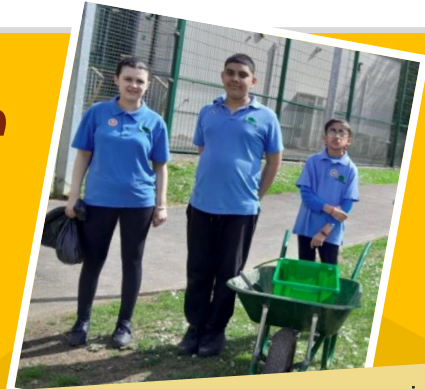
3NW focused on clearing two flower beds, removing weeds, filling three wheelbarrows, working together as a team, and preparing the area for planting later this year...

This week, students took part in environmental projects, exploring how we can care for our school and the world around us. Across all pathways, pupils engaged in creative and practical challenges, from recycling art and eco-bricks to energy-saving initiatives and improving school spaces.