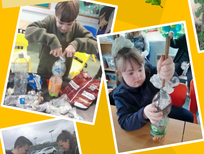
Pathway 1 making eco bricks