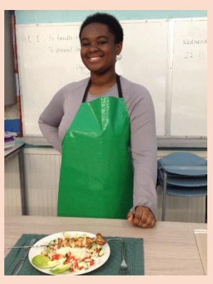
Pictured pupils in Pathway 1 using our Magic carpet, Year 8s using a vacuum former to create dragster cars, a chicken kebab made as part of an AQA cookery skills course and some pop-up cards designed by pupils in Pathway 2.