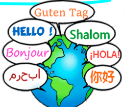
World HELLO Day

This week M16 have been practicing our fine motor skills by doing origami, we made a heart and a scotty dog! We also went to the cinema again to watch Elemental; we used good sharing skills with our popcorn and sat quietly, engaged in the film.