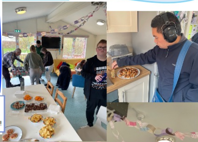
The student planned grand opening of our new common room!